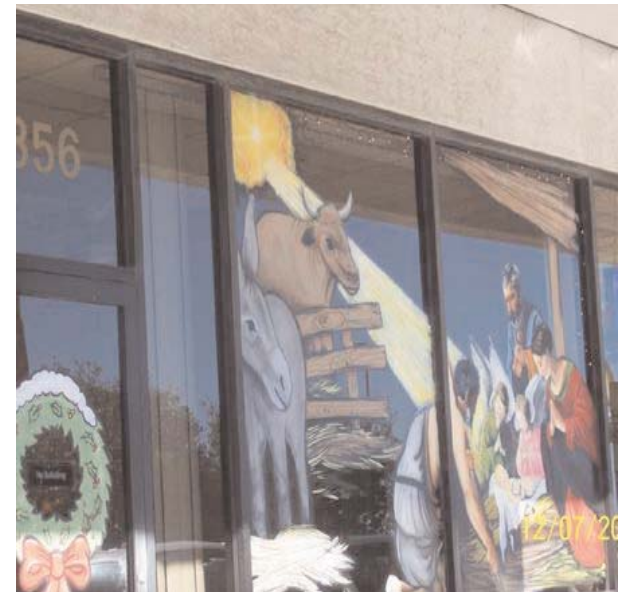
Seguin Title's festively painted windows earned honorable mention for window design