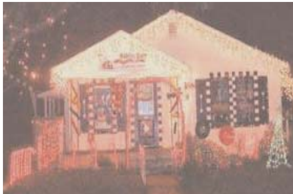
The Mobility Store garnered top honors for its Outside Decorations